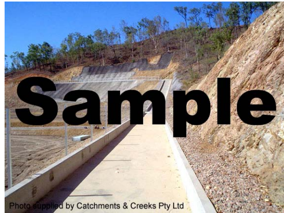
Photo 2 – Permanent diversion channel collecting stormwater runoff up-slope of a subdivision