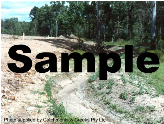
Photo 1 – Temporary diversion channel collecting “dirty” water down-slope of a soil disturbance